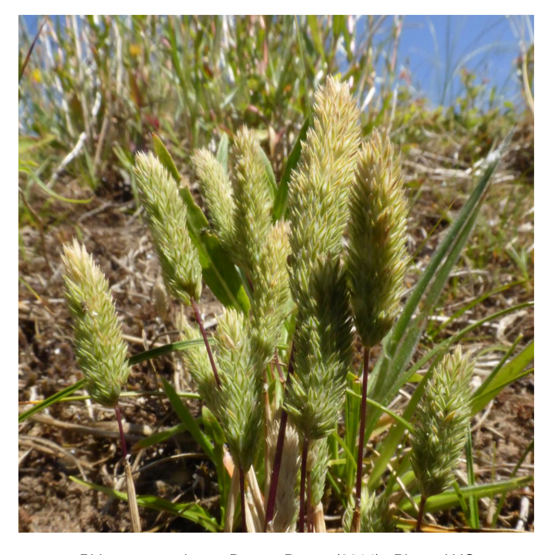
Phleum arenarium at Berrow Dunes (2014).