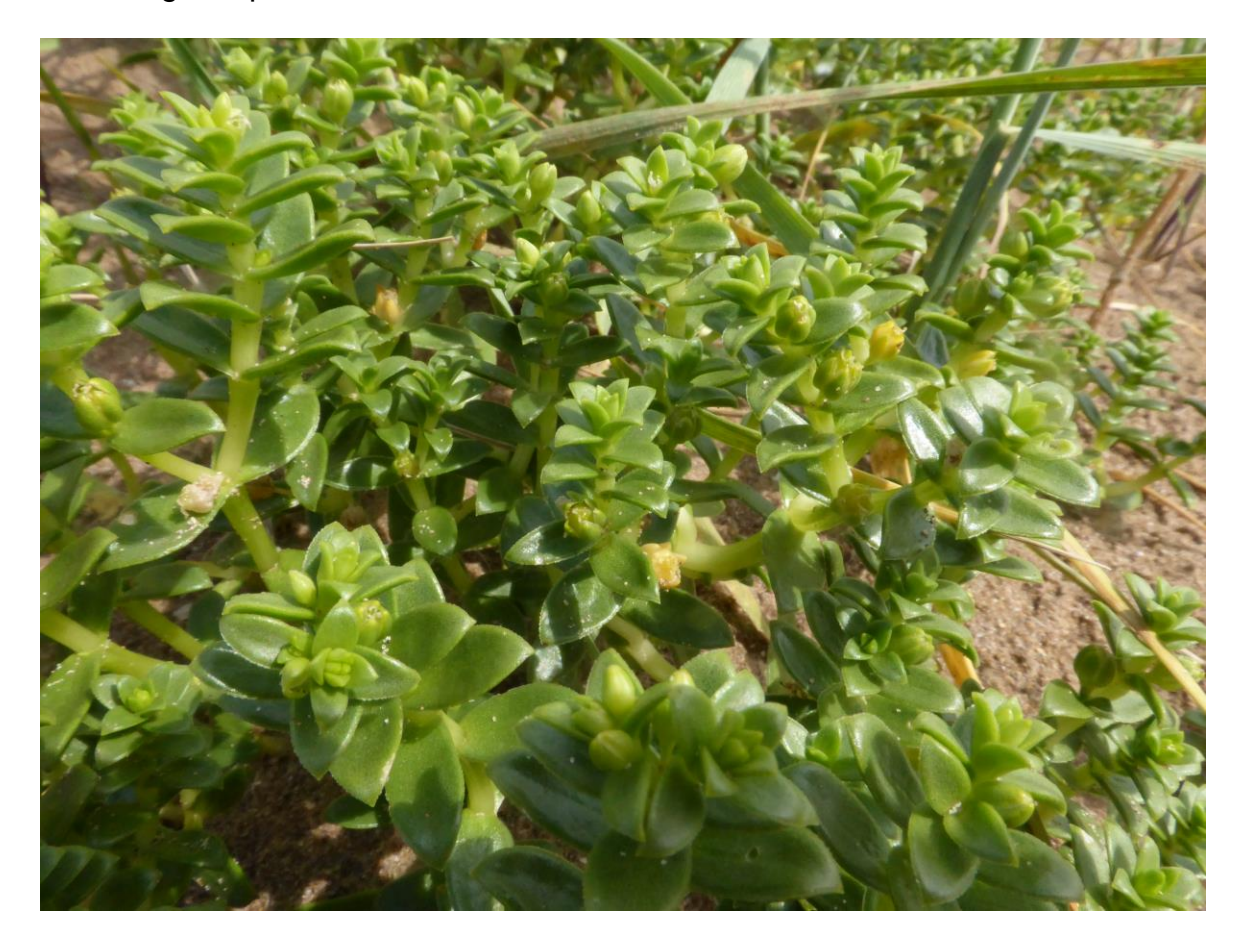
Honckenya peploides at Sand Bay (2014).