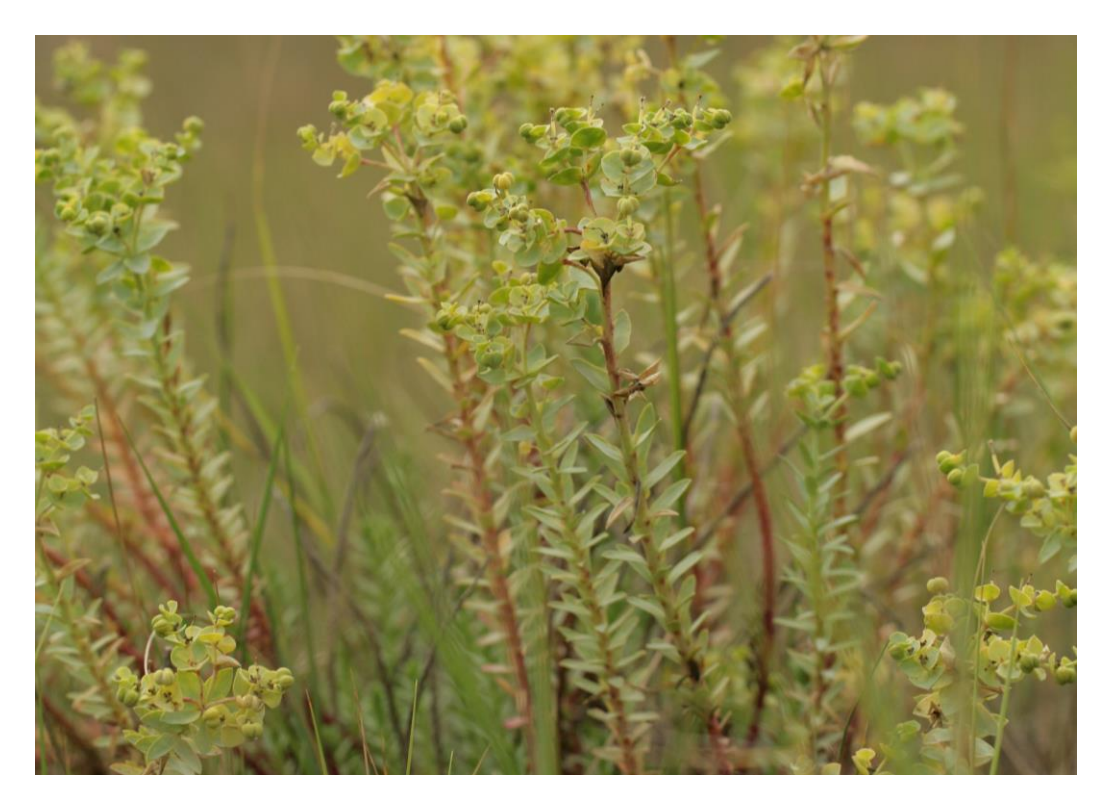
Euphorbia paralias at Wall Common (2018).