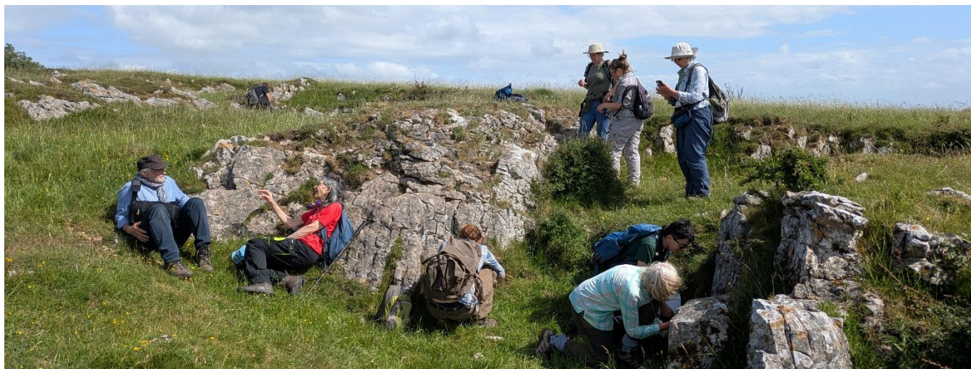
SRPG members finding rare plants on the rocks at the top of The Perch SSSI

Sunday 31st May 2026, The Perch SSSI (VC6)