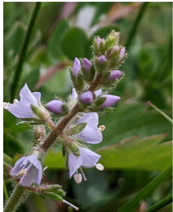
The delicate lilac flowers of Heath Speedwell

Continuing uphill into Unit 4 of the SSSI, the grassland changed dramatically to a short species-rich sward. A single patch of Lady's-mantle ( Alchemilla filicaulis subsp. vestita ) was discovered on the path, with Heath Speedwell ( Veronica officinalis ) growing nearby: both are RPR species.