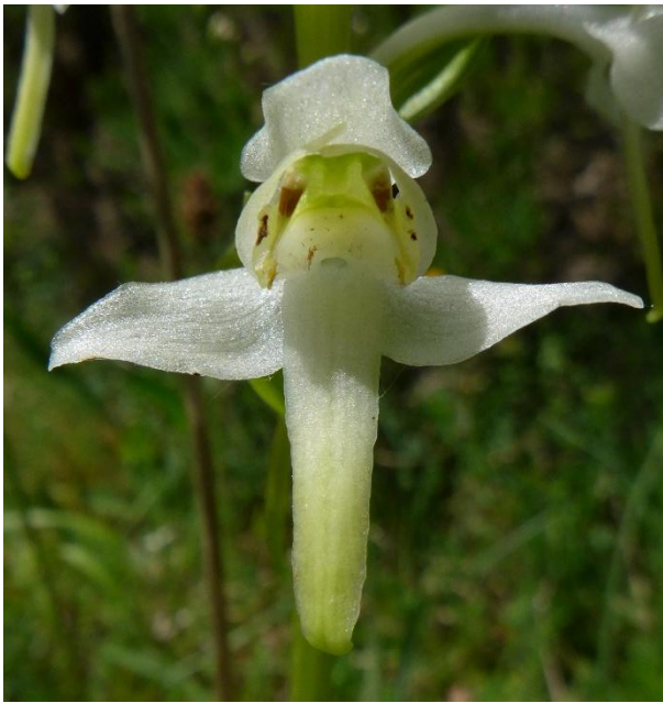
Flower of Greater Butterfly-orchid at The Perch

their first encounter with this stunning orchid, and it was the first record for The Perch SSSI since 2009.