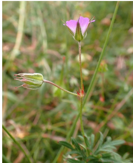
Long-stalked Crane's-bill

( Arenaria serpyllifolia ) and Parsley-piert ( Aphanes arvensis ).