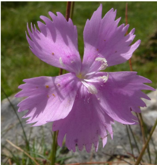
Cheddar Pink flowering at The Perch

As a finale, we reached Unit 3 of the SSSI and another former small quarry where Cheddar Pink has been known since 1985. It has been suggested that the late discovery of Cheddar Pink at The Perch indicates that it was an introduction, but it may have colonised these small quarried areas naturally.