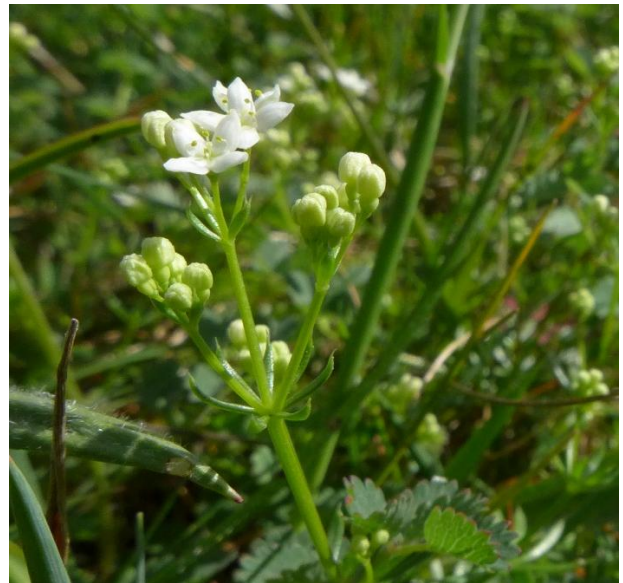
Cheddar Bedstraw

The views were spectacular: it was a perfect spot for a rest and snack, after which nine members headed back to their cars. The remaining four continued recording, exploring some fantastic grassland at the top of Unit 1, owned by Somerset Council. We discussed the management of some small areas of scree and found many further patches of Cheddar Bedstraw on a steep west-facing slope.