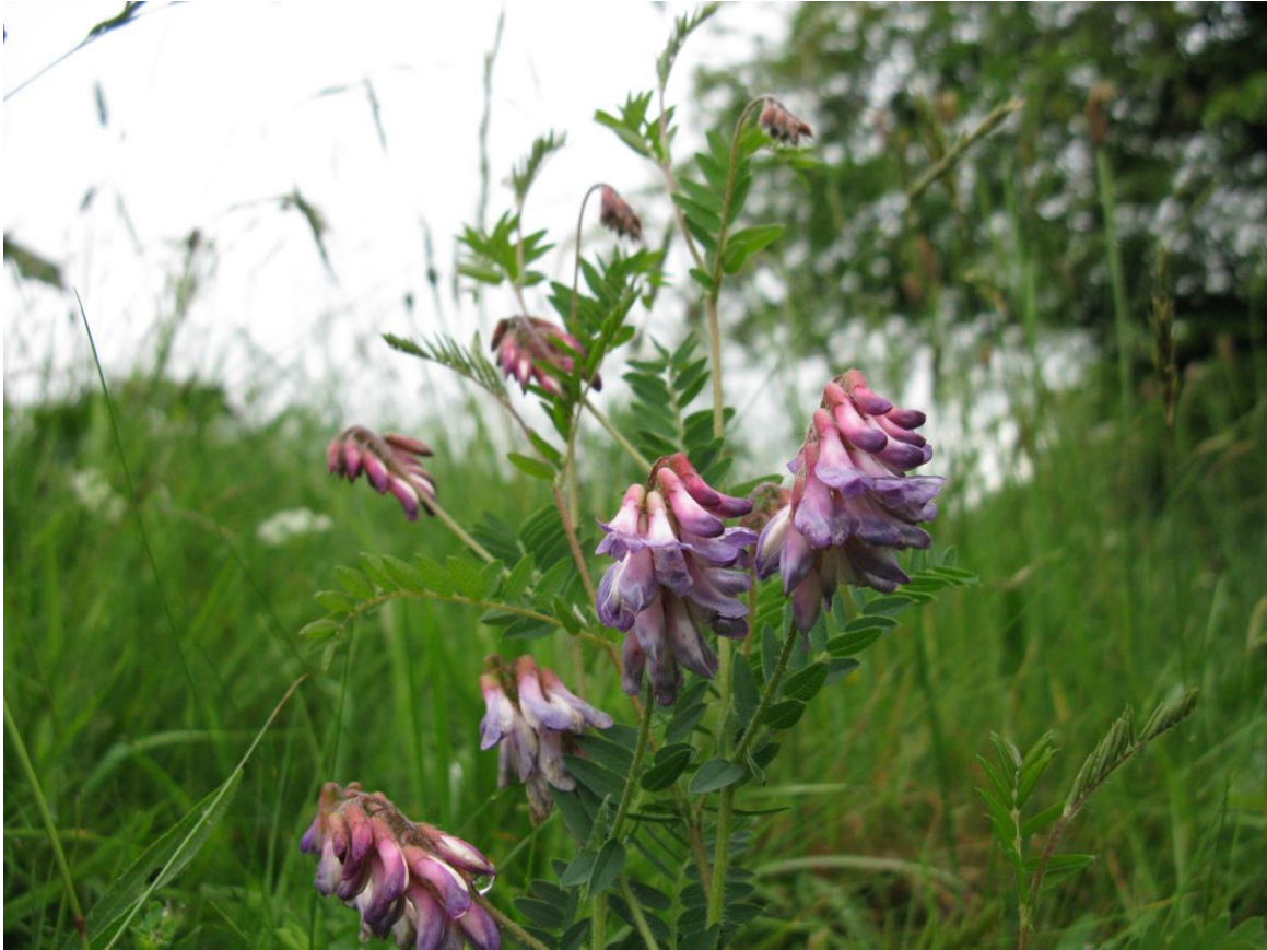
Vicia orobus near Charterhouse (2012).