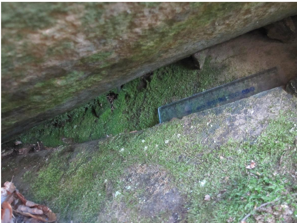
Trichomanes speciosum gametophyte at Hawkcombe (2020).

(Following molecular studies, some authors consider this species better placed in the genus Vandenboschia .)