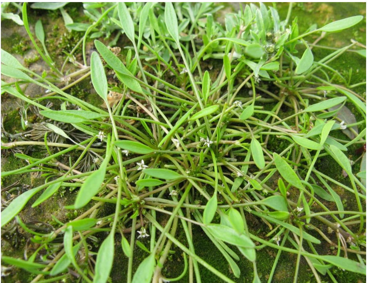
Limosella aquatica at Chew Valley Lake (2011).