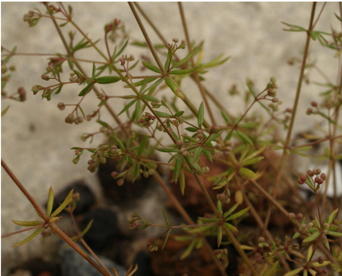
Galium parisiense in Taunton (2012).