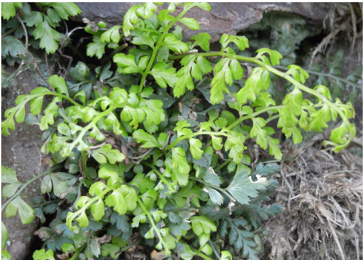
Asplenium obovatum at Porlock Hill (2009).