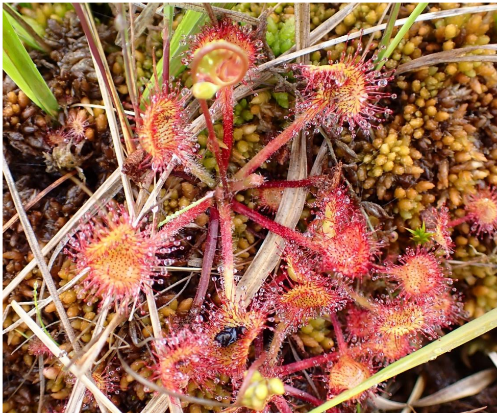
Drosera rotundifolia at Pinkery (2022).