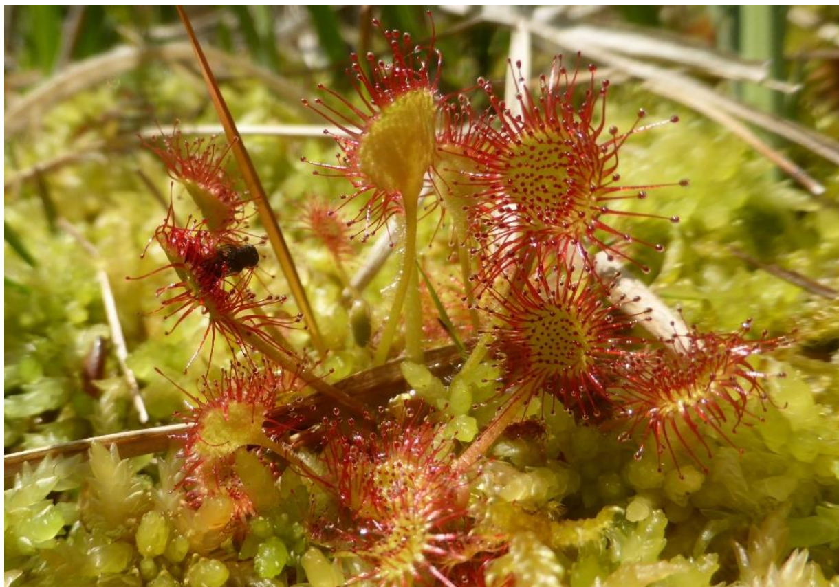
Drosera rotundifolia at Widcombe Moor (2015).