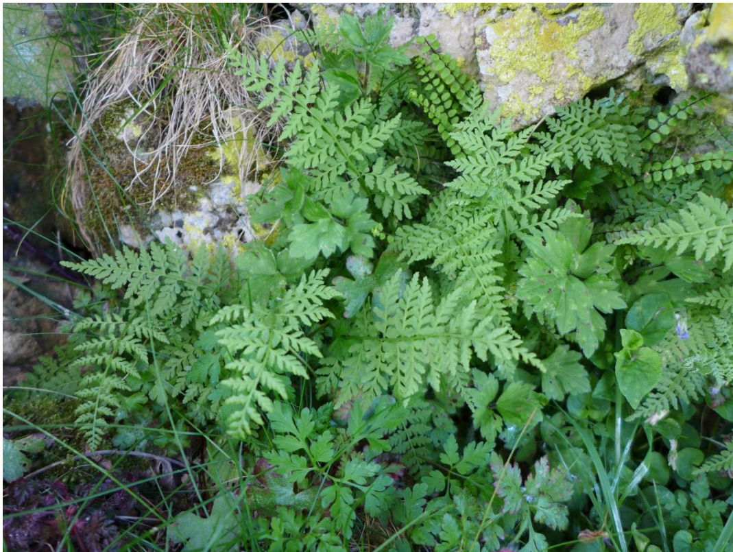
Cystopteris fragilis at Upper Lansdown (2017).