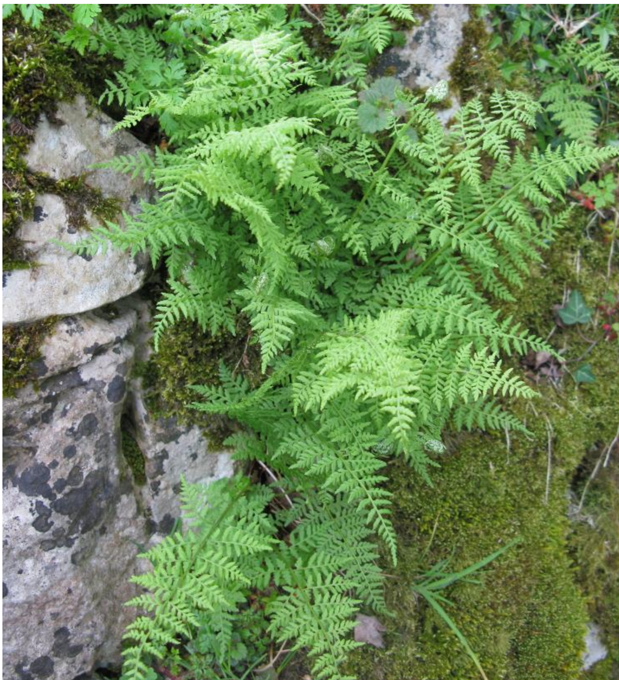
Cystopteris fragilis at Black Rock, Cheddar (2009).