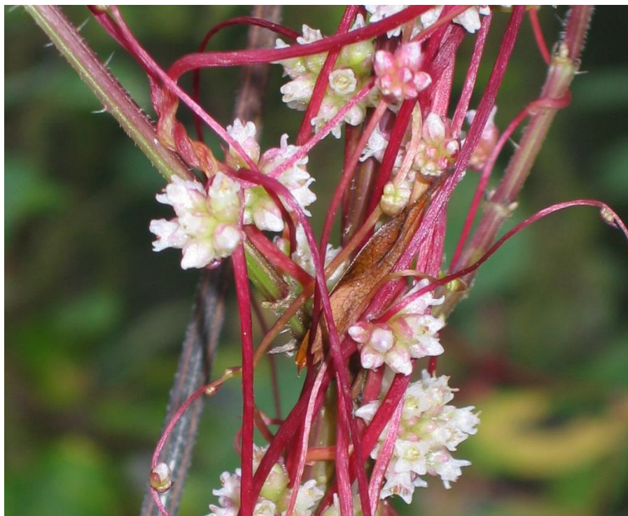
Cuscuta europaea by the River Avon at Warleigh (2007).