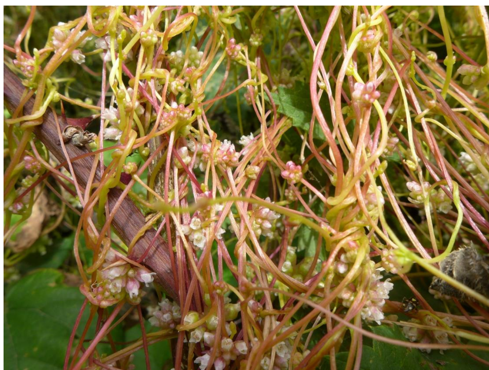
Cuscuta europaea by the River Avon at Claverton (2019).