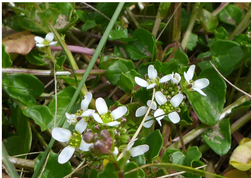
Cochlearia officinalis at Sand Bay (2019).