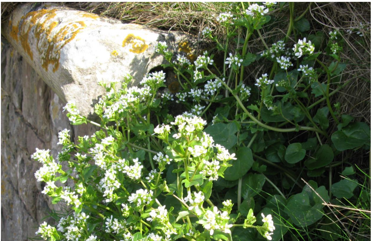
Cochlearia officinalis at Brean Down (2014).