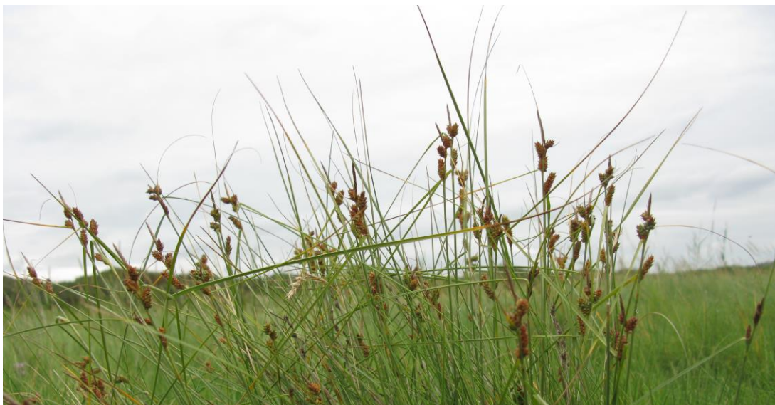
Carex extensa at Sand Bay (2011).