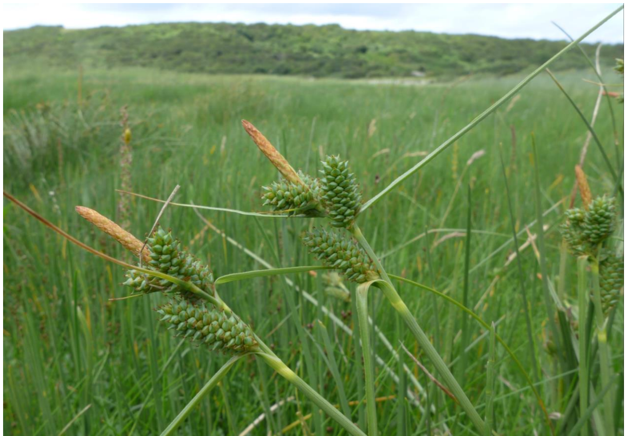
Carex extensa at Sand Bay (2016).