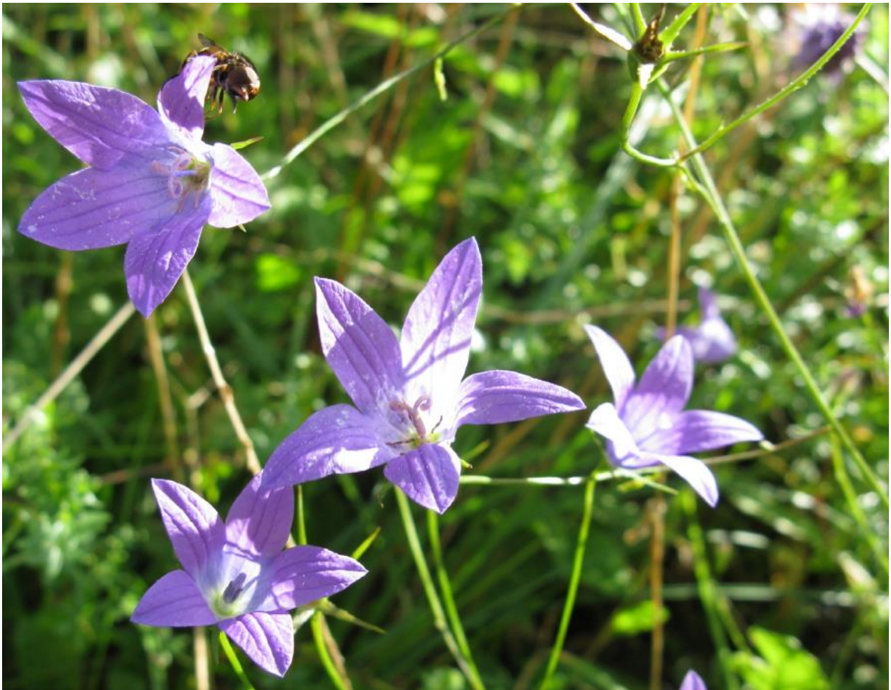
Campanula patula at East Harptree (2008).