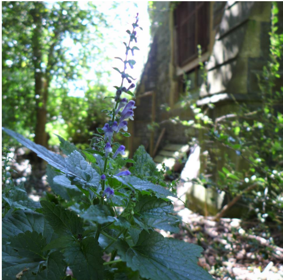
Scutellaria altissima in Locksbrook Cemetery (2017).