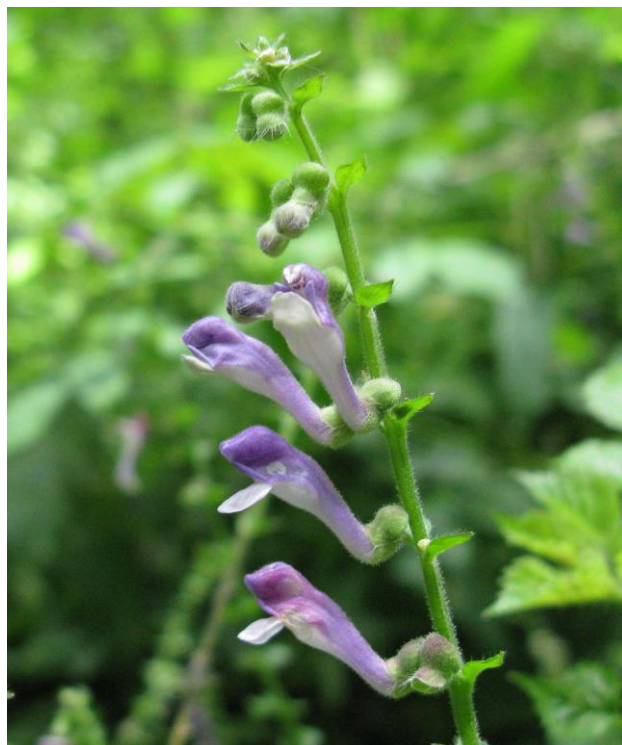
Scutellaria altissima in the Wadbury Valley (2012).

Wadbury Valley ST73524881 2017 HJC, GHR Large patch on bank opposite small building Wadbury Valley ST73714879 2017 HJC, GHR Large patch on bank on S side of stream Wadbury Valley ST737488 2017 HJC, GHR Abundant on old wall and on slopes above Bath ST73216528 2017 HJC, DEG 1 clump under trees in Locksbrook Cemetery Claverton ST79066420 2017 HJC, DEG 1 plant on stonework of canal