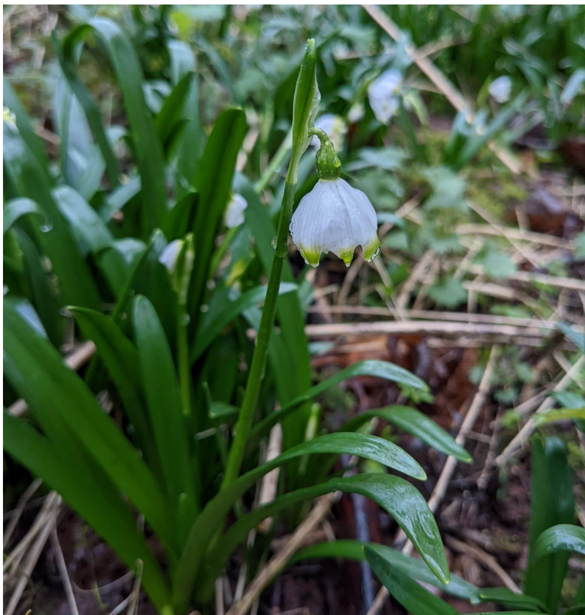
Leucojum vernum at Lower Vexford (2022).