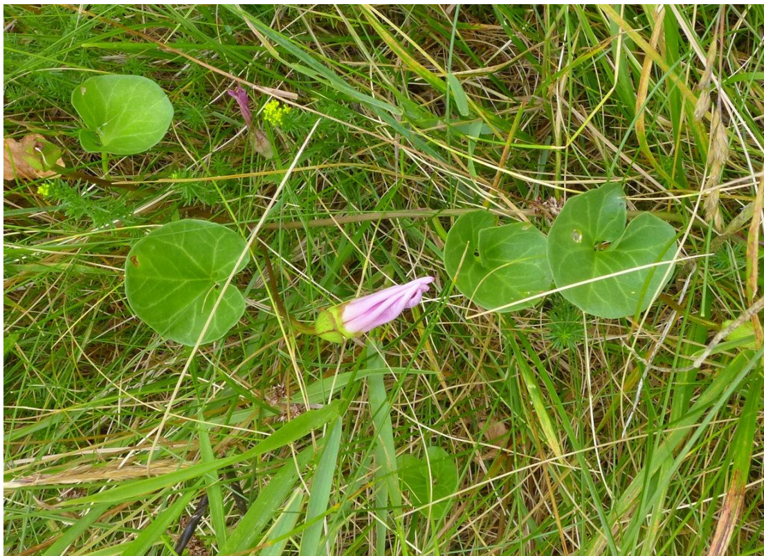
Calystegia soldanella at Berrow Dunes (2014).