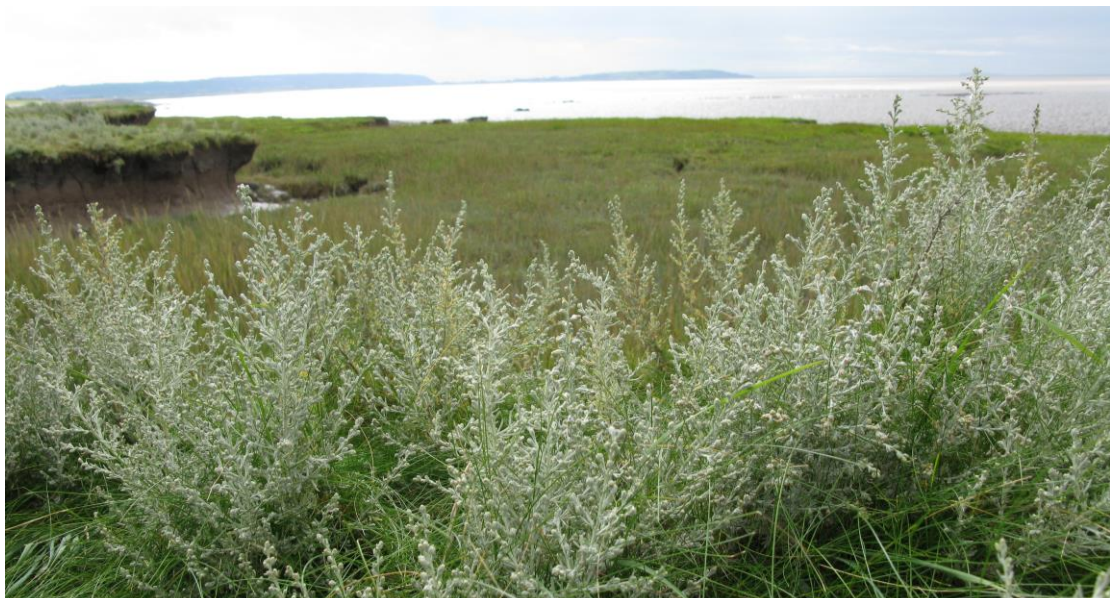
Artemisia maritima at Woodspring Bay (2011).