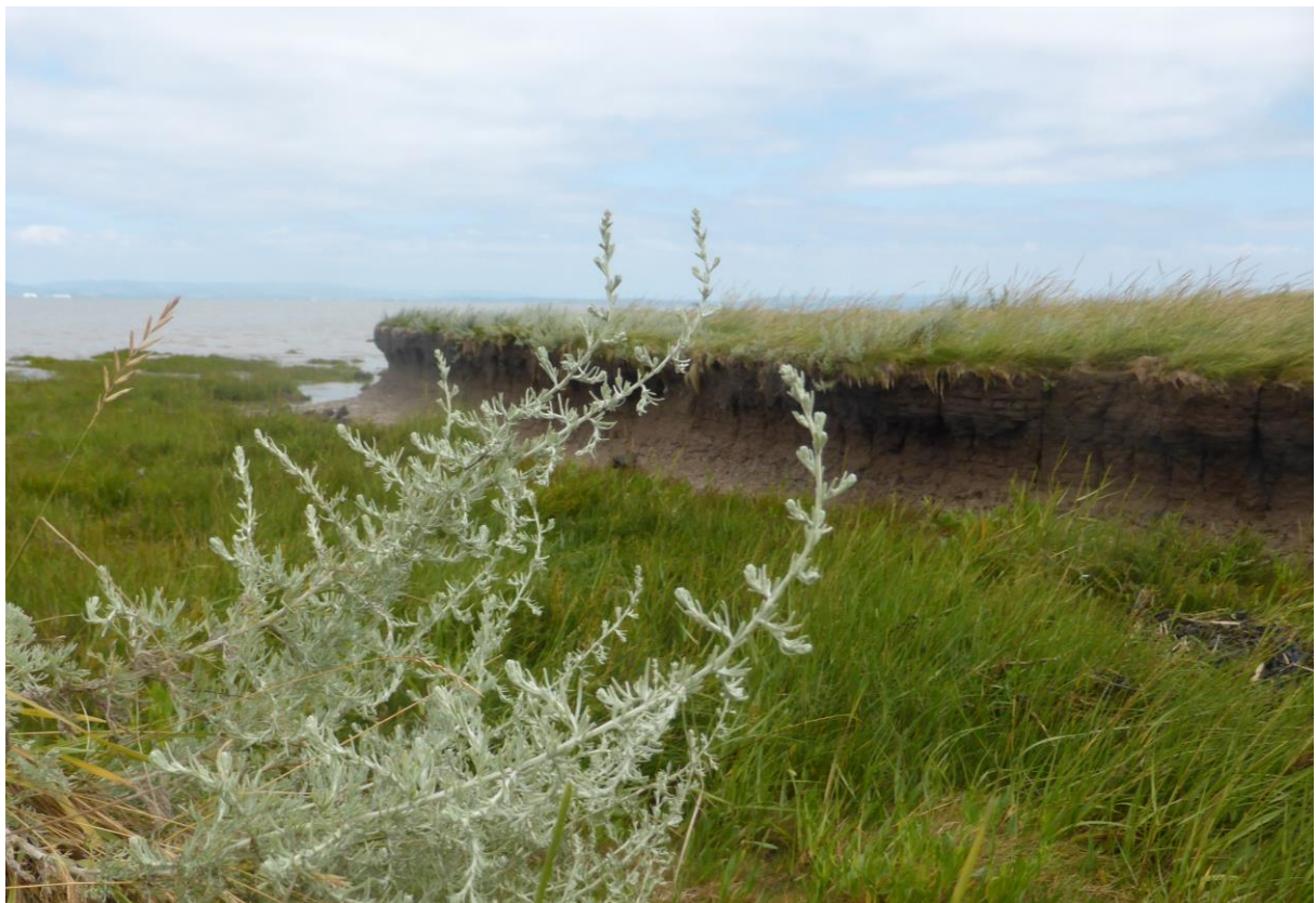
Artemisia maritima at Hook's Ear, Kingston Seymour (2014).