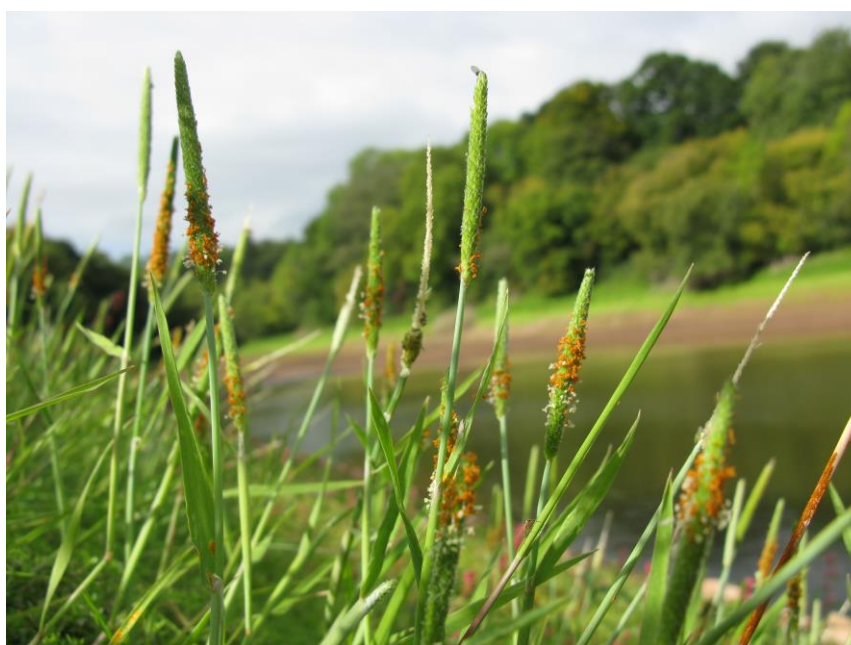
Alopecurus aequalis at Hawkrige Reservoir (2011).