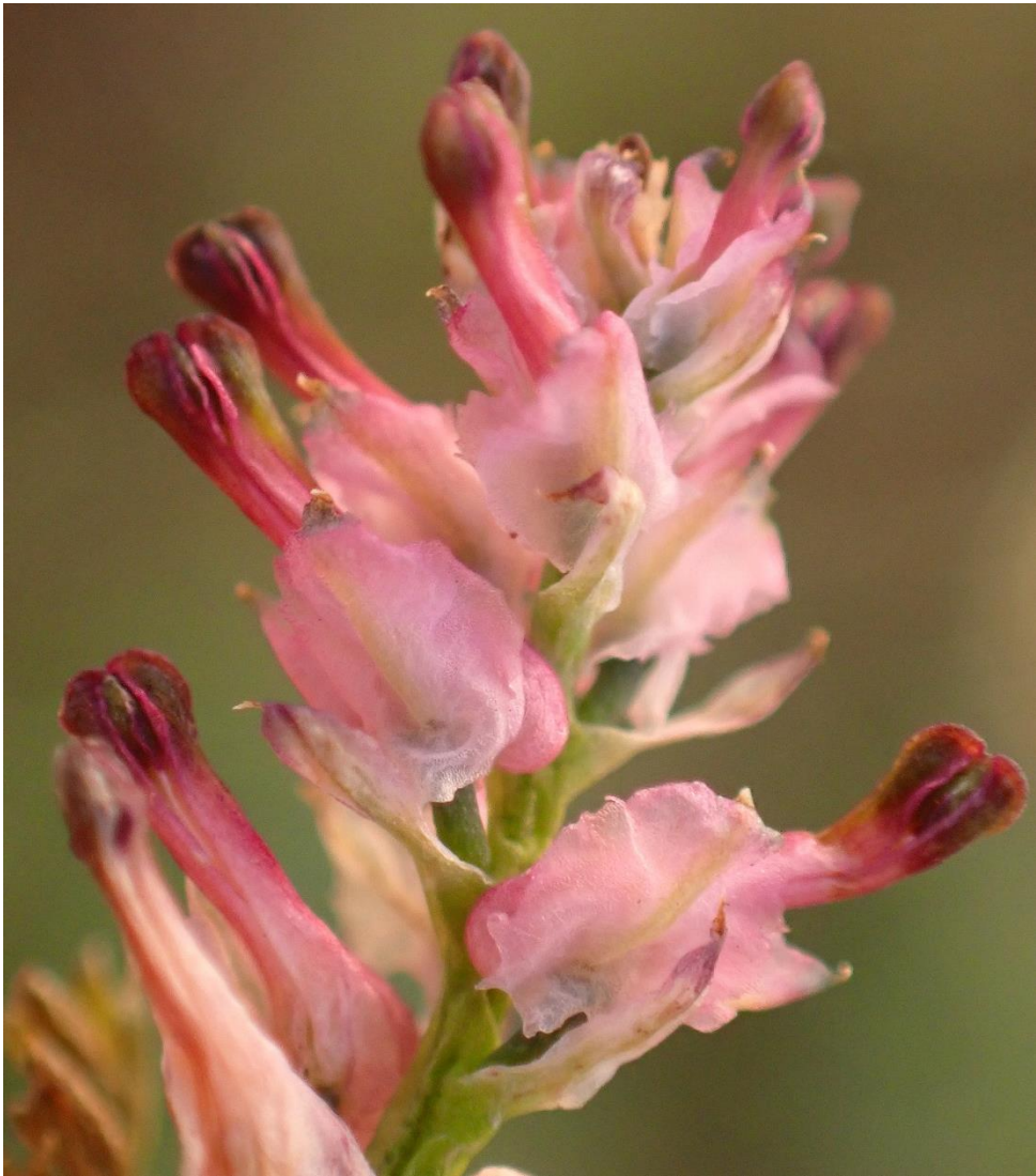
Fumaria densiflora at Trading Post Farm Shop, Lopen Head (2022).