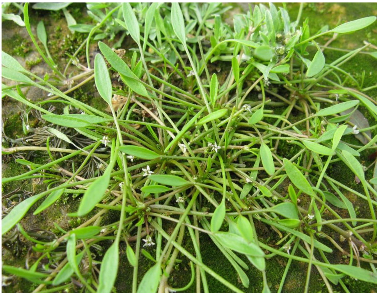
Limosella aquatica at Chew Valley Lake (2011).