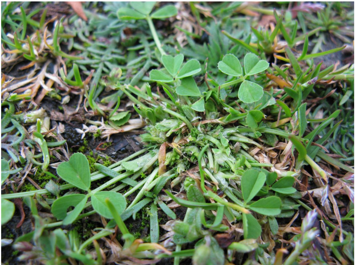
Trifolium suffocatum at Sand Point (2012).