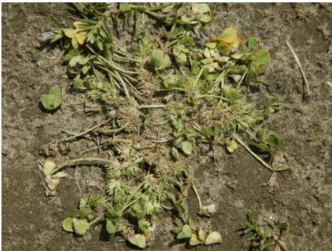
Trifolium suffocatum at Weston-super-Mare Sea Lawns (2011).