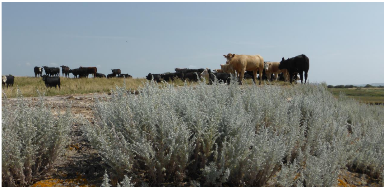
Artemisia maritima at the mouth of the River Yeo (2014).