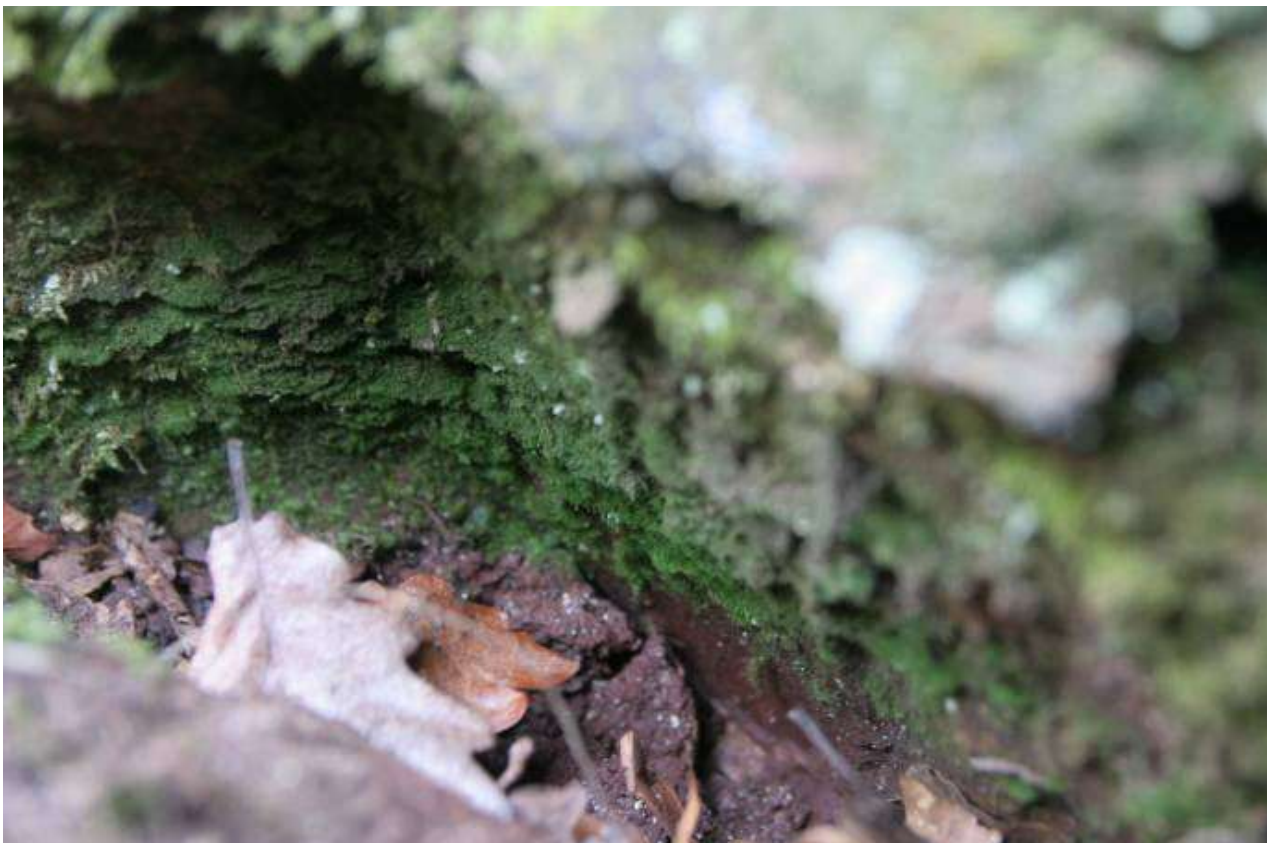
Trichomanes speciosum gametophyte at Alfoxton Wood, Holford (2009).

(Following molecular studies, some authors consider this species better placed in the genus Vandenboschia .)