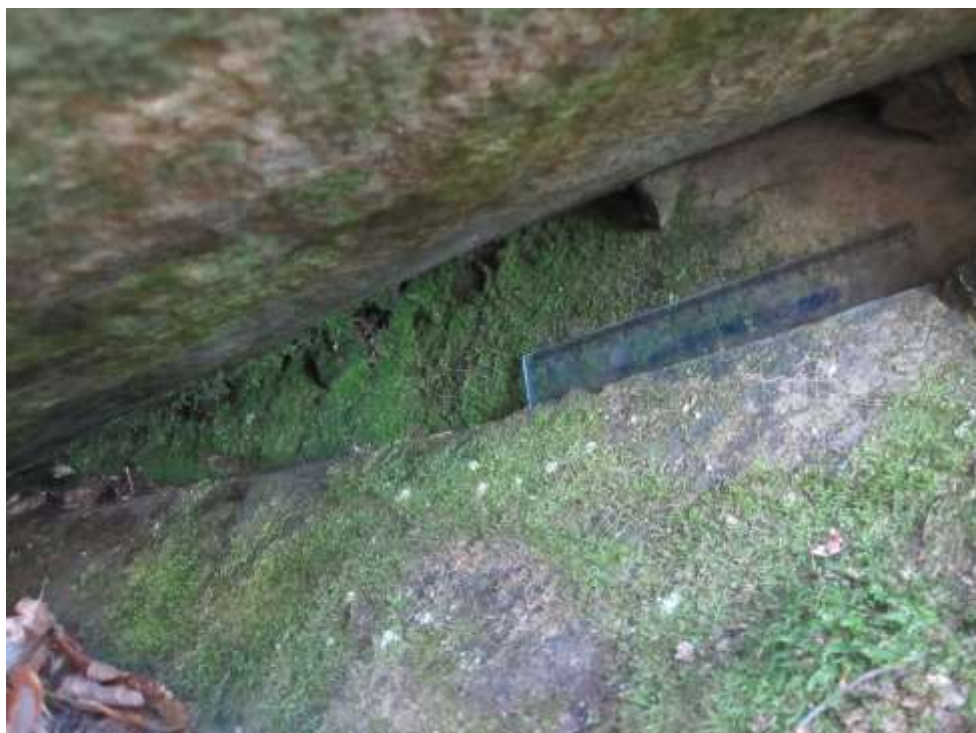
Trichomanes speciosum gametophyte at Hawkcombe (2020).