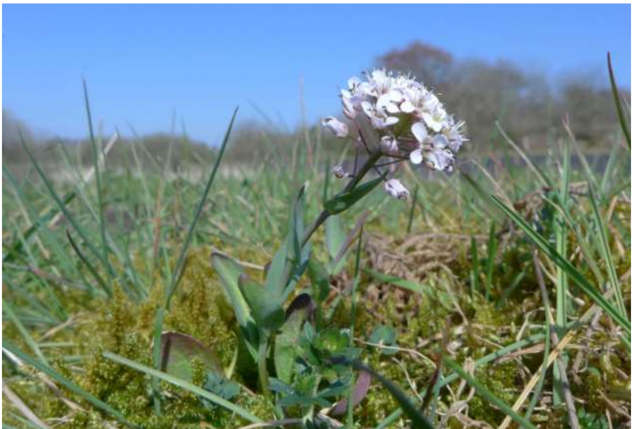
Noccaea caerulescens at Blackmoor Nature Reserve (2019).