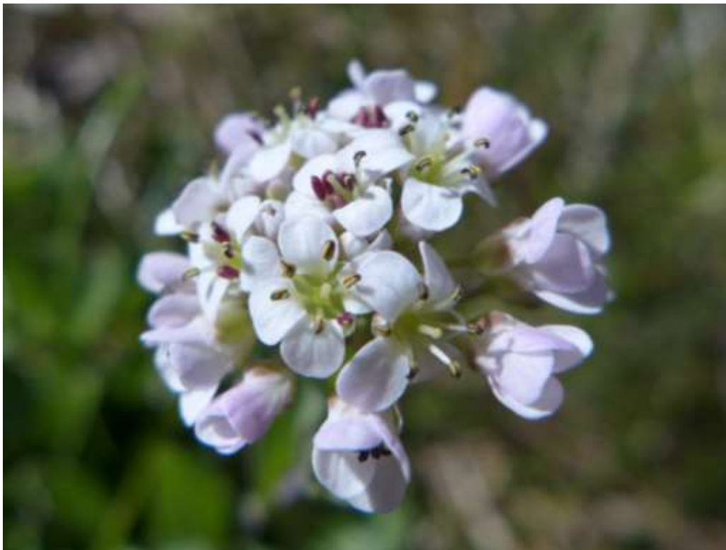
Noccaea caerulescens at Sandford Hill (2017).