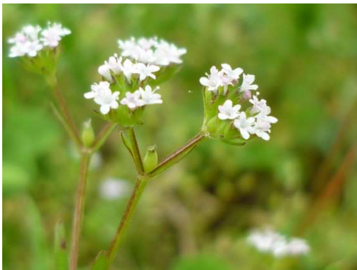
Valerianella dentata at Laverstoke Park, Hampshire (2013). [awaiting Somerset photo]