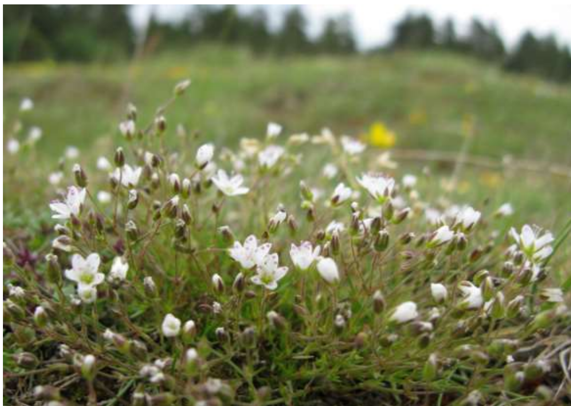
Sabulina verna at Priddy Mineries (2012).