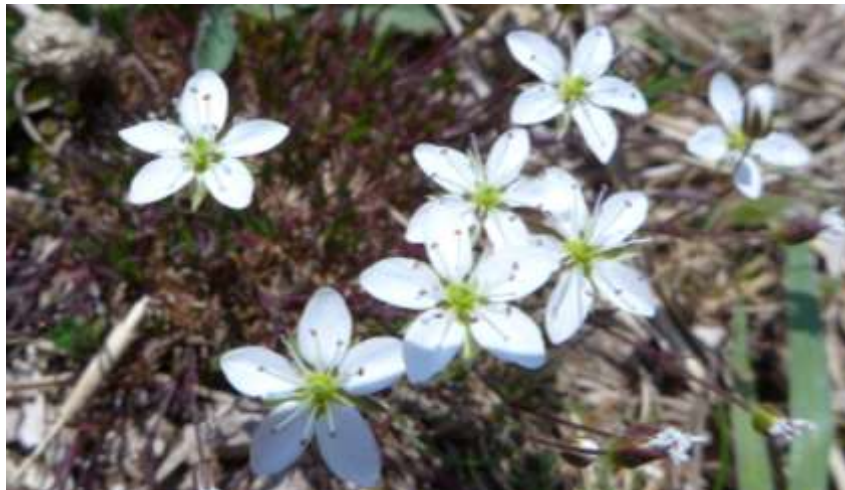
Sabulina verna at Blackmoor Reserve (2018).