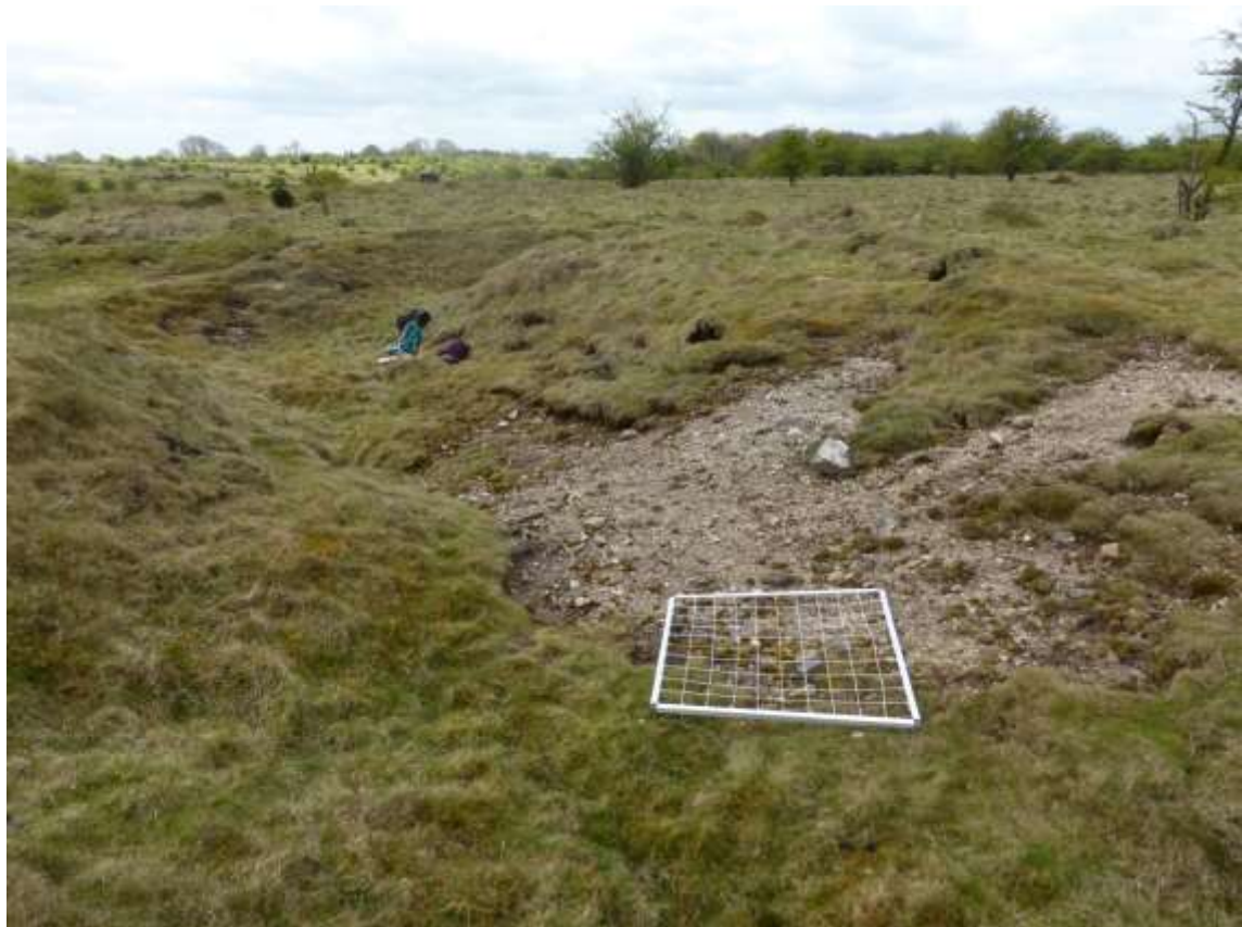
Habitat of Sabulina verna at Yoxter Ranges (2015).