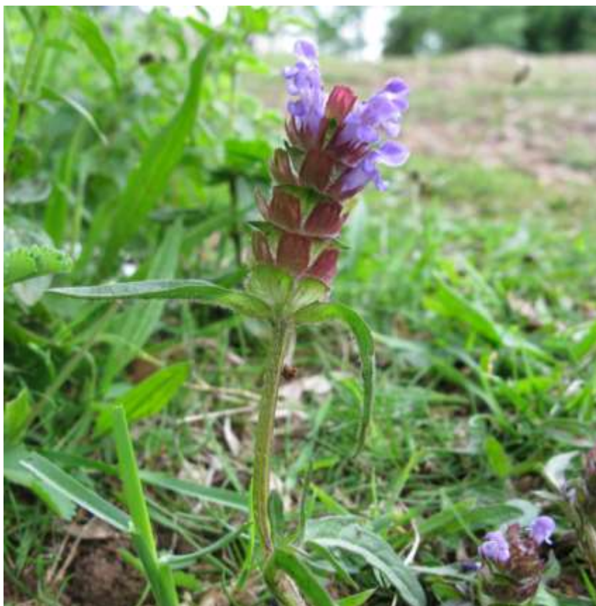
Prunella x intermedia at Cheddar (2009).