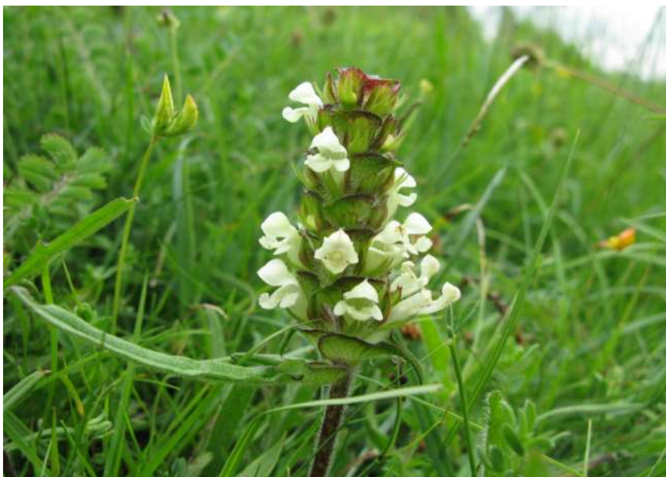
Prunella laciniata at Cheddar (2009).