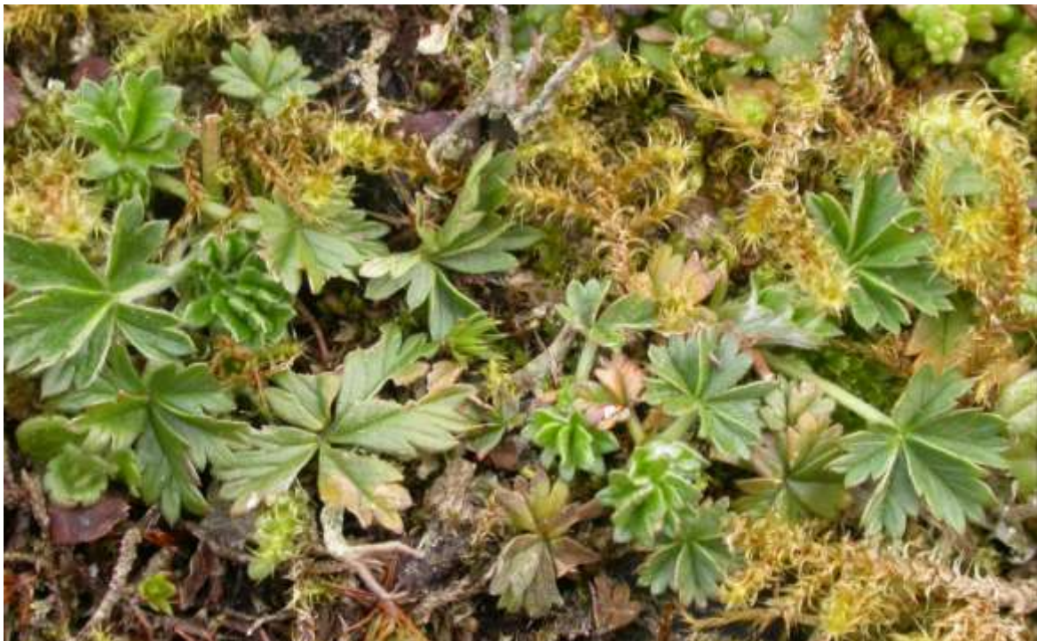
Potentilla argentea at Blackmoor Reserve, Charterhouse (2007).