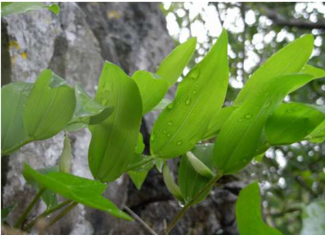
Polygonatum odoratum at Black Rock (2009).