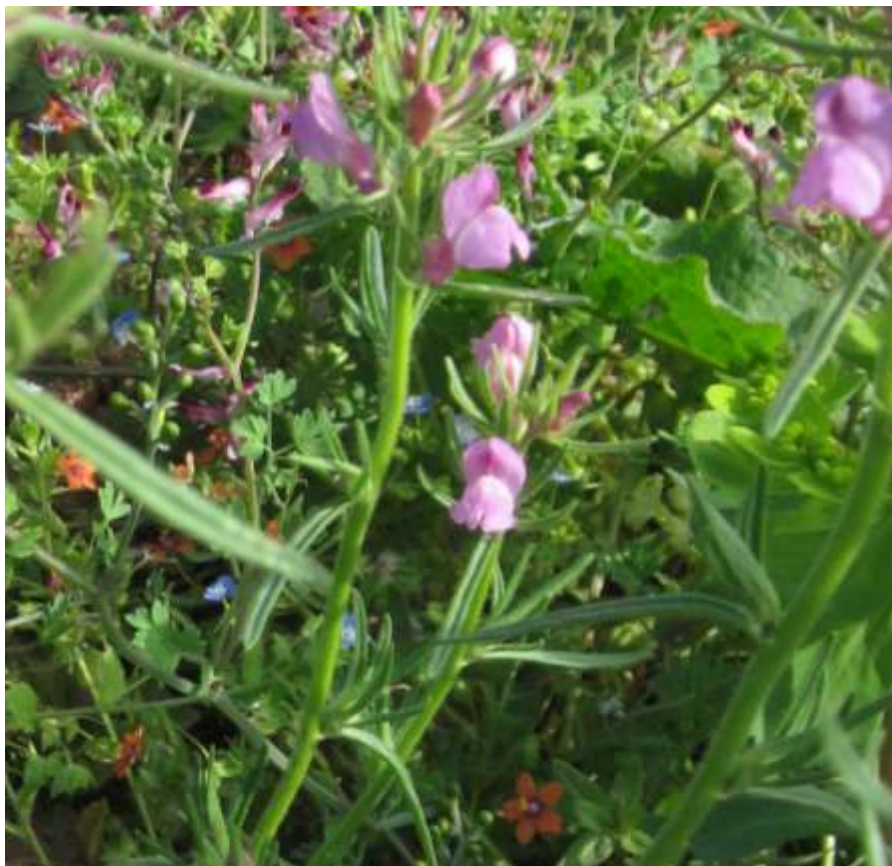
Misopates orontium at Porlock Marsh (2014).