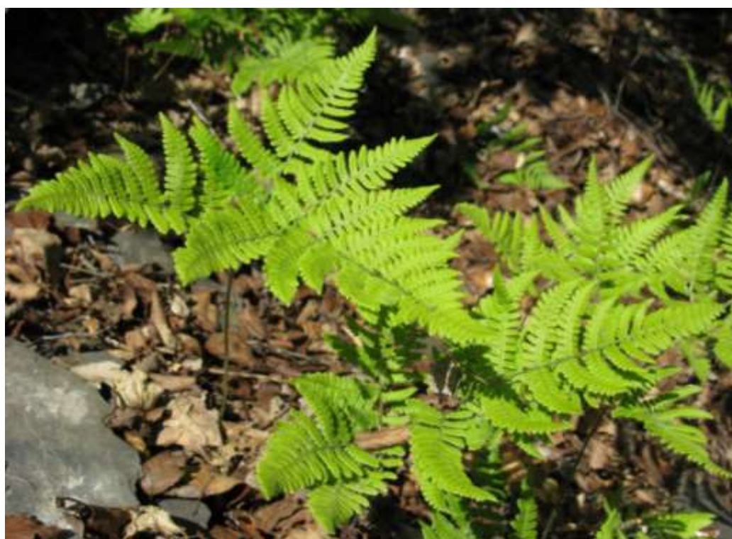
Gymnocarpium robertianum at Treborough Wood (2011).