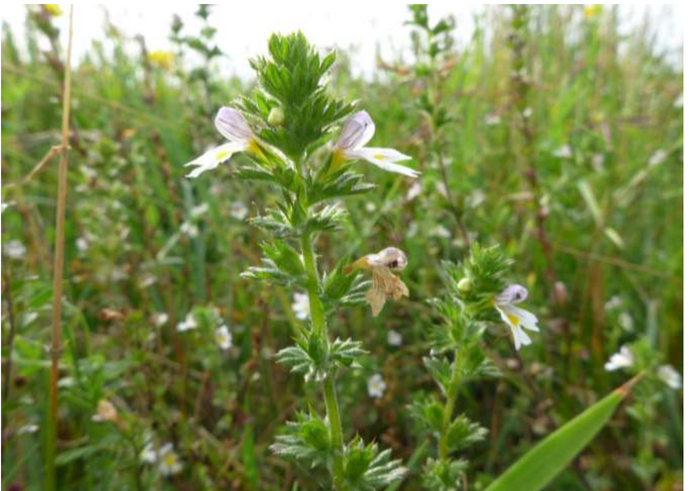
Euphrasia anglica x arctica at Ashcott Plot (2017).

An annual, hemiparasitic, tall, robust, large-flowered hybrid with the stature of hay-meadow variants of E. arctica but bearing long flexuose glandular hairs. In VC5 this hybrid was found for the first time in 2016 by Graham Lavender, at Goat Hill on Exmoor, growing with both parents, the specimens determined by Chris Metherell. In 2017 it was also collected from Aclands, just south of Goat Hill. In VC6 a specimen in BM collected in 1903 from Shapwick was determined as this hybrid by P.F. Yeo. A specimen in CGE collected by H.S. Thompson from the “ Carex evoluta enclosure” in 1922 was also determined as this hybrid (then E. anglica x brevipila ) by P.F. Yeo, as was a specimen in K collected by V.S. Summerhayes in 1928 at Sharpham, in low peaty pasture. Both these last two were believed to have come from Sharpham Moor Plot (Yeo, 1956). Further plants were found in moderately long grass in a relatively acid spot at nearby Street Heath (Yeo, 1956). There were no subsequent records until 2011 when this hybrid was collected in a hay meadow beside Ashcott Plot, the identification confirmed by Chris Metherell. This is a rare hybrid: outside Somerset it is known at three sites in Devon, there is an old record from Kirkcudbrightshire, and in 2018 this hybrid was found new to Ireland, in North Tipperary.