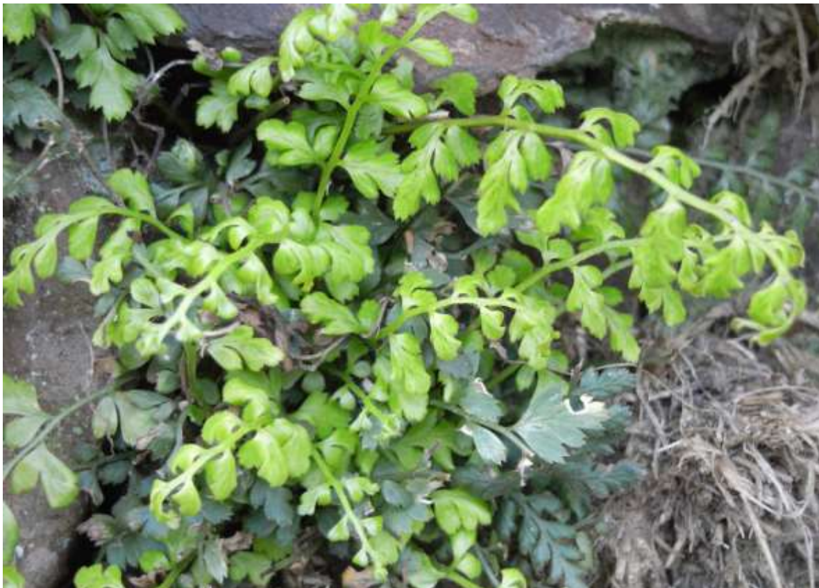
Asplenium obovatum at Porlock Hill (2009).