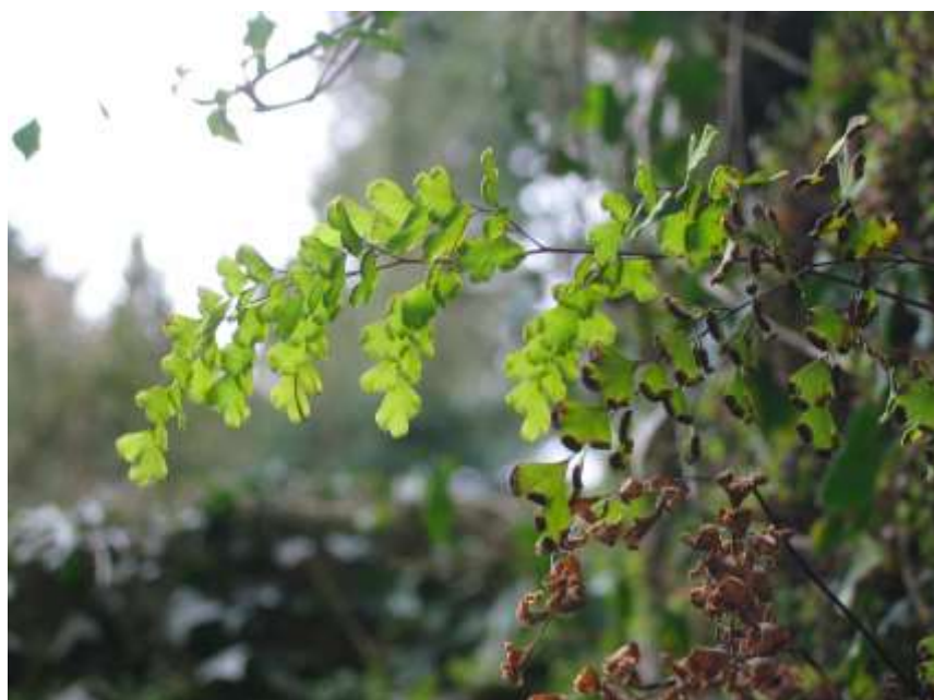
Adiantum capillus-veneris at Batheaston (2008).