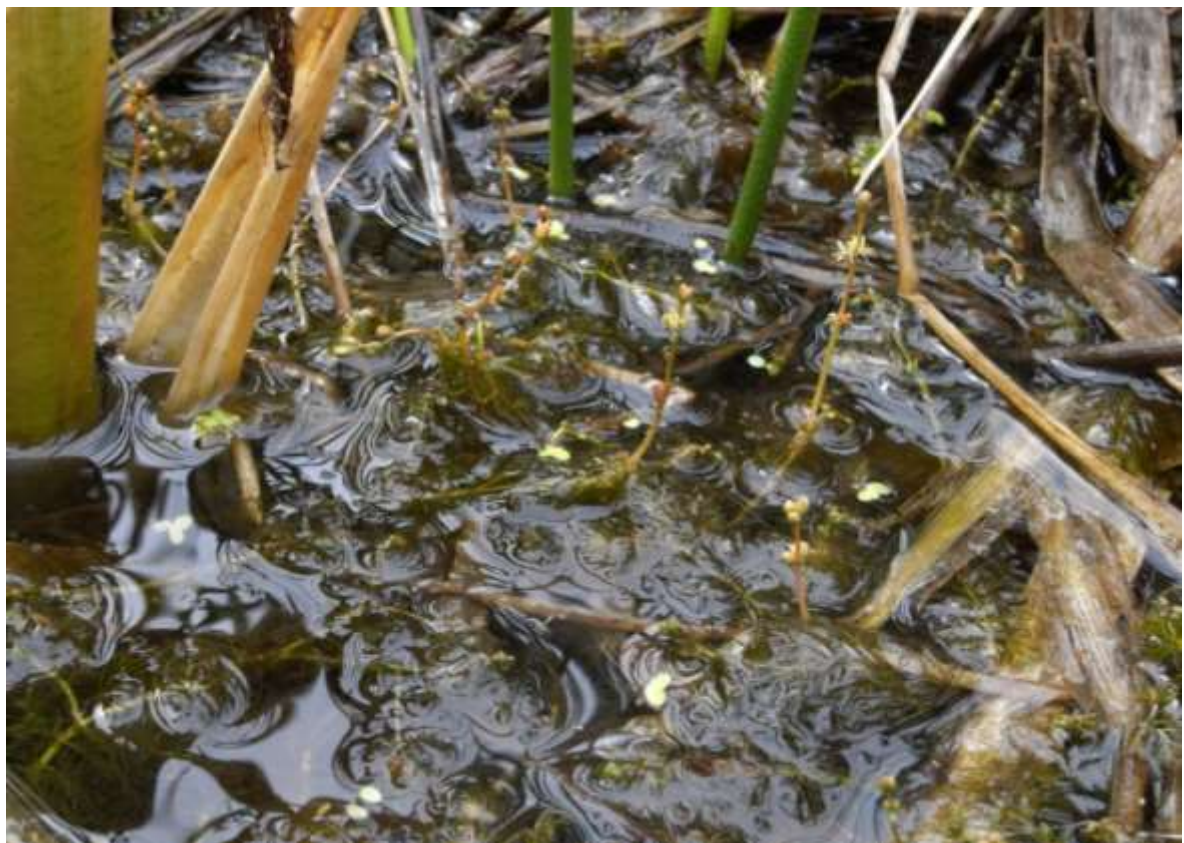
Myriophyllum alternifolium in a pond N of Priddy (2009).