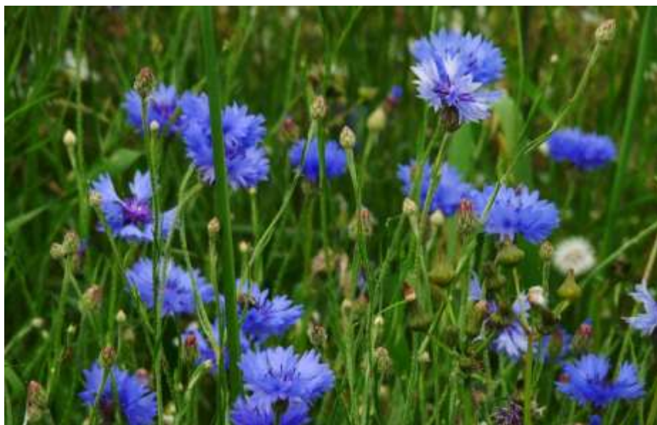
Centaurea cyanus near Failand (2011).