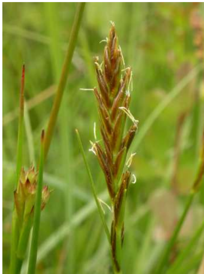
Blysmus compressus at Windsor Hill Marsh (2007).