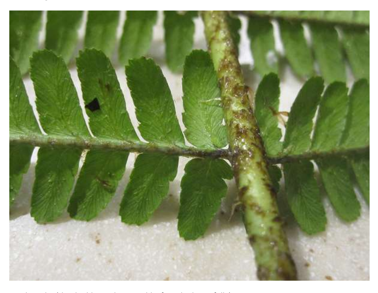
Hawkcombe (the double teeth are visible if you look carefully)