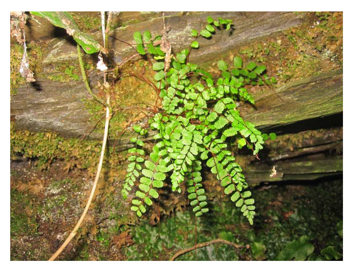
The eye is instantly drawn to the red stipes, very thin and wiry and still present even after loss of pinnules. Just one more picture to show the habitat; this specimen was on the darker, damper rocks on left