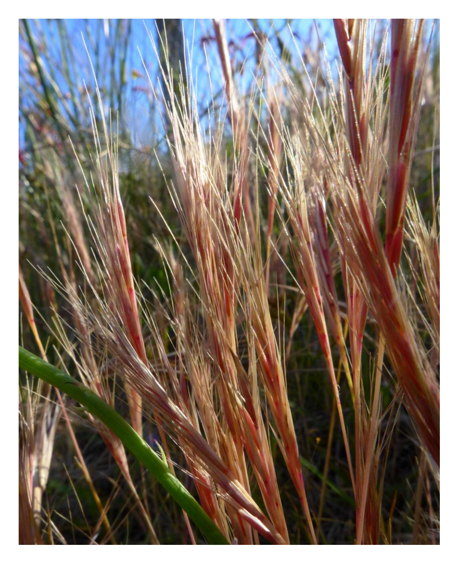
Vulpia ciliata subsp. ambigua at Berrow Dunes (2014).

A loosely tufted annual of disturbed sandy places, found on coastal sand dunes in Somerset but elsewhere also inland on sandy heaths and roadsides. In VC5 first discovered on fixed dunes at Minehead Warren, Dunster (SS9946) by C.J. Giddens and M. Tulloh in 1972 (Watsonia 17 : 484). It was recorded further west at Minehead Warren in 1992, and in 1999. In 1989 this species was recorded outside the chalets at Dunster Beach and was refound there in 2019. This small stretch of coast remains the only known location in VC5. Vulpia ciliata subsp. ambigua was unknown in Somerset until 1960, when it was found by Cecil Sandwith and Noel Sandwith to be abundant over a small area of fixed dune at Berrow (Sandwith & Sandwith, 1961): in VC6 it is still only known from Berrow Dunes. This grass is distributed around the coast of England and Wales and inland in suitable sandy habitats, from south of the Humber to the west coast of Wales. Sites in Somerset are within this range.