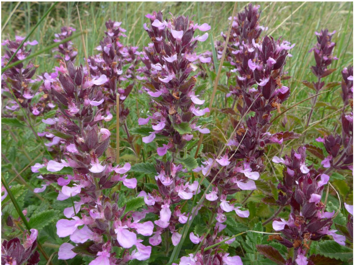
Teucrium chamaedrys at Sand Point ((2016).