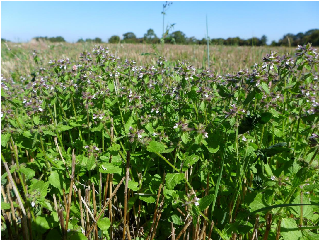
Stachys arvensis near Cameley (2019).