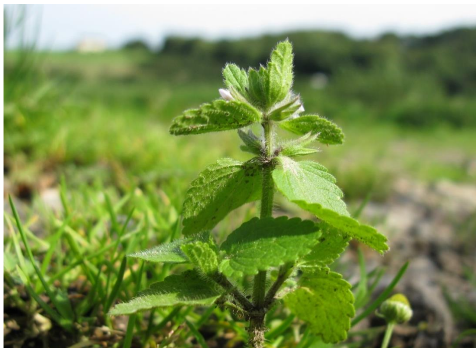
Stachys arvensis at Clatworthy Reservoir (2012).