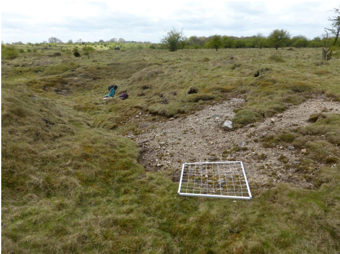
Habitat of Sabulina verna at Yoxter Ranges (2015).