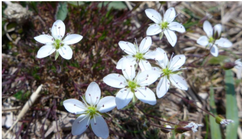
Sabulina verna at Blackmoor Reserve (2018).