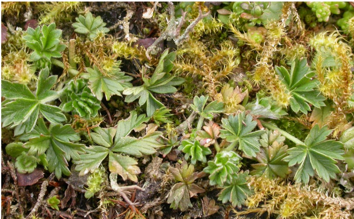
Potentilla argentea at Blackmoor Reserve, Charterhouse (2007).