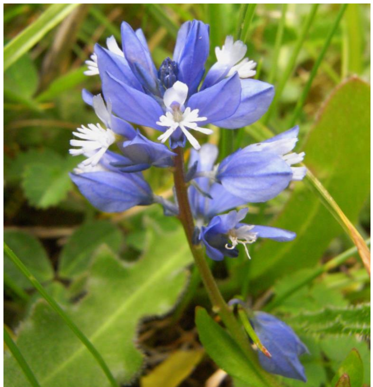
Polygala calcarea at Southstoke (2009).

In that part of VC6 which is now Wiltshire, Polygala calcarea can readily be found on Knoll Hill and White Sheet Downs. Recorded at Knoll Hill by W. Galpin in 1886, it is still scattered along the south-facing slope for over 1km and is abundant on the west-facing end of the hill. At White Sheet Downs, it can be found particularly on the various earthworks and tumuli, where it does indeed form brilliant patches. In VC6, Polygala calcarea is at the western edge of its range, which is mostly restricted to the chalk of southern England.