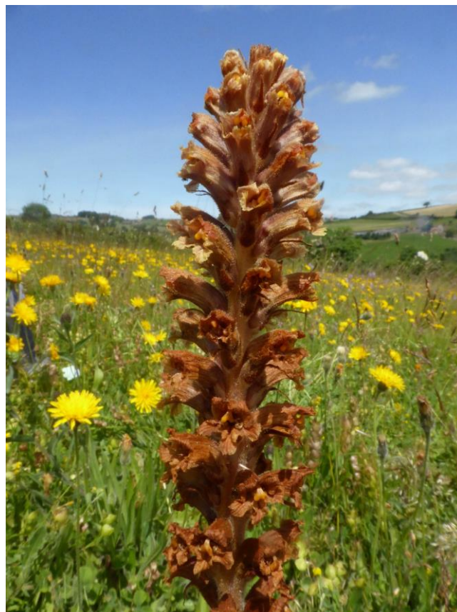
Orobanche elatior at Langridge (2014).