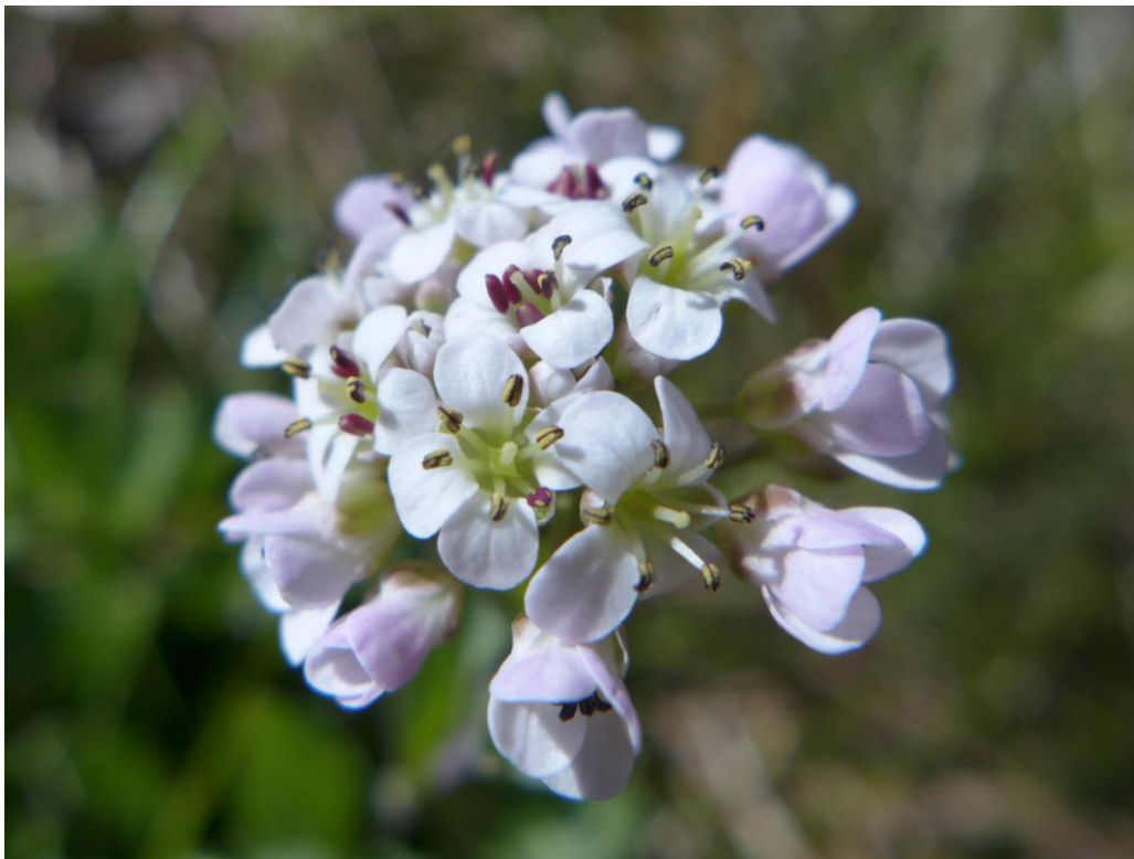
Noccaea caerulescens at Sandford Hill (2017).