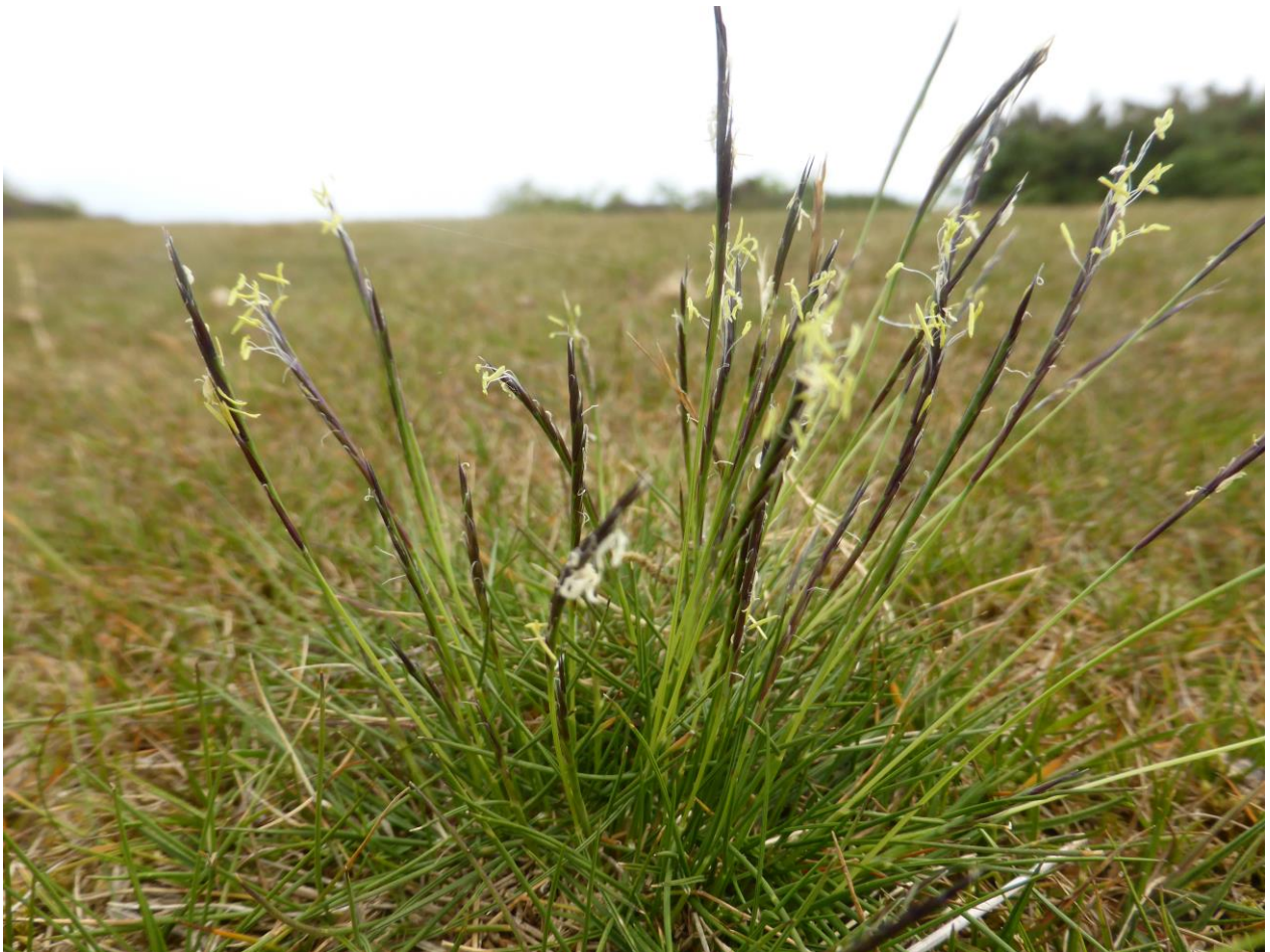
Nardus stricta on Beacon Hill (2010).